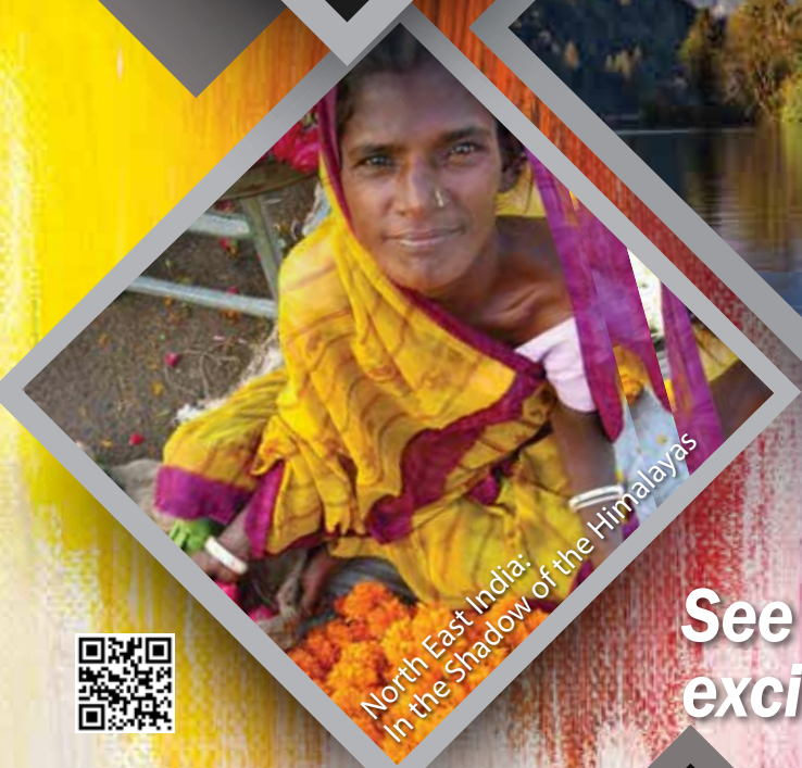
North East India: In the Shadow of the Himalayas

See the back cover for exciting new tours