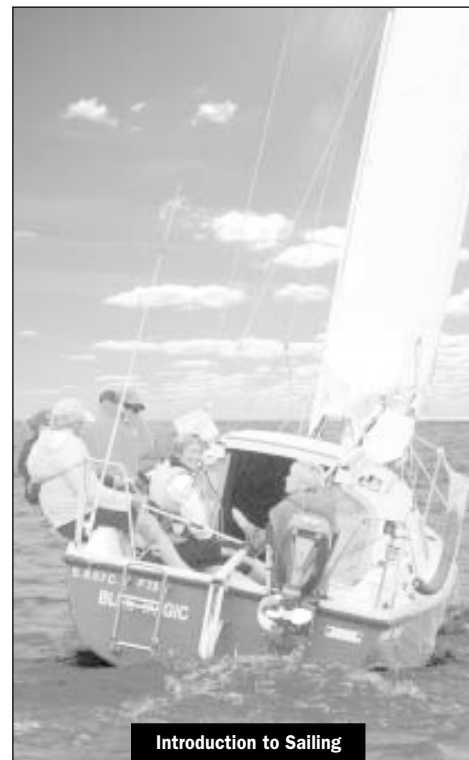
Introduction to Sailing

03106 Tue., 5.45pm 16 March, 5 wks x 2 hrs + FT FEE: $87, disc. $79, conc. $64 WEA CENTRE