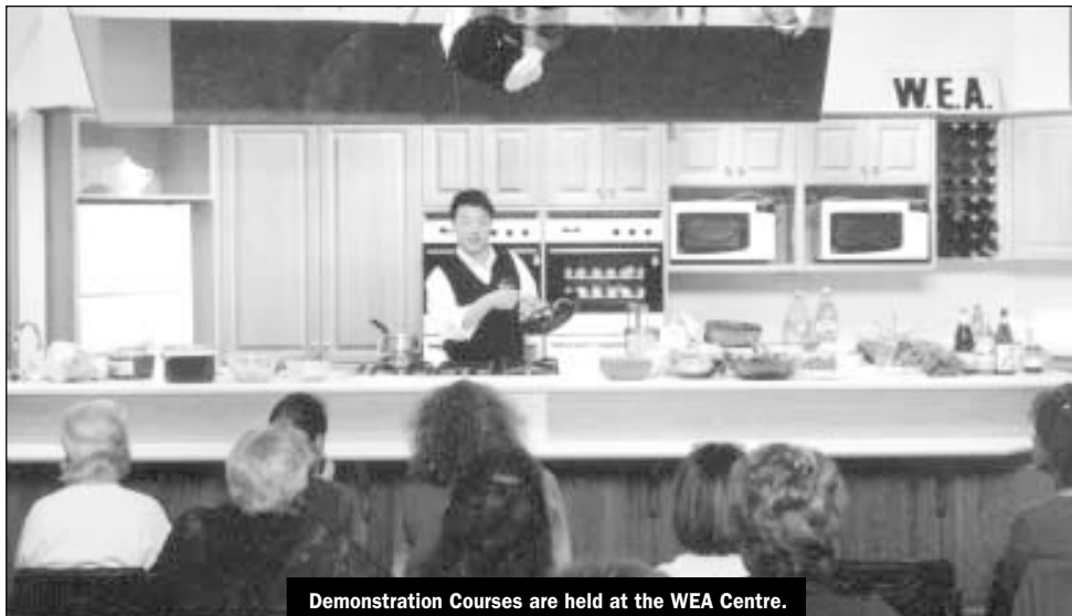
Demonstration Courses are held at the WEA Centre.

FEE: $78, disc. $70, conc. $62 HENLEY BEACH HS