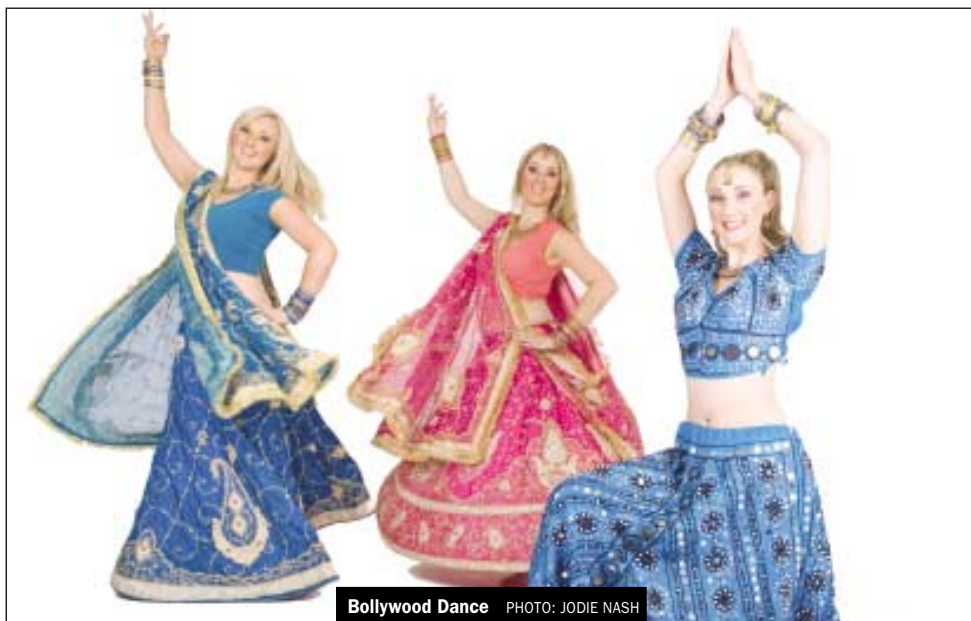
Bollywood Dance