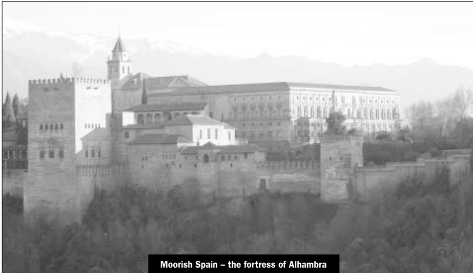
Moorish Spain – the fortress of Alhambra