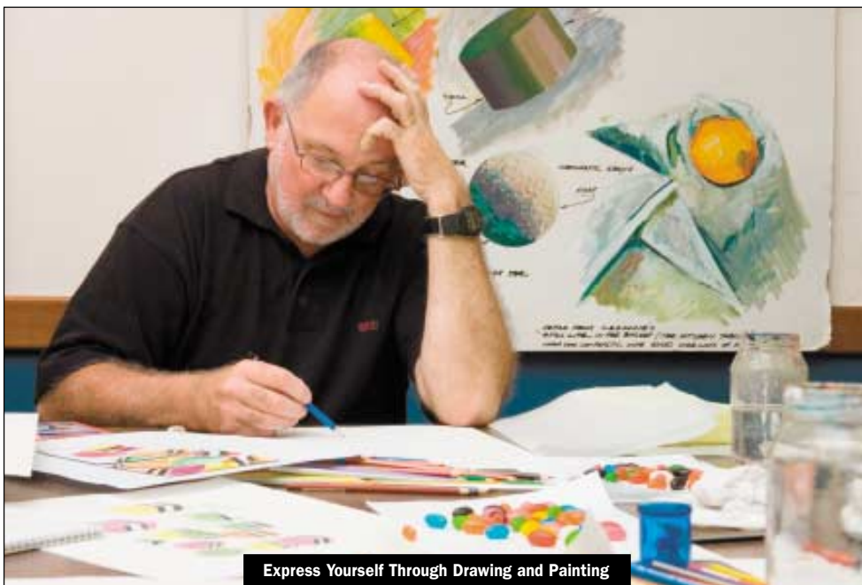
Express Yourself Through Drawing and Painting

03743 Fri., 6pm 19 February, 4 wks x 3 hrs FEE: $75, disc. $68, conc. $54 WEA CENTRE