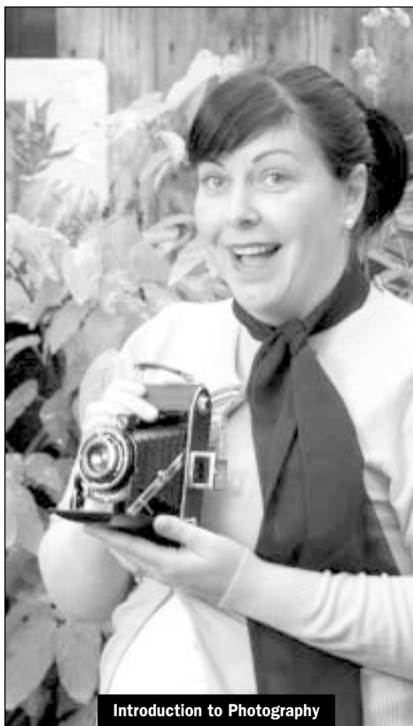
Introduction to Photography