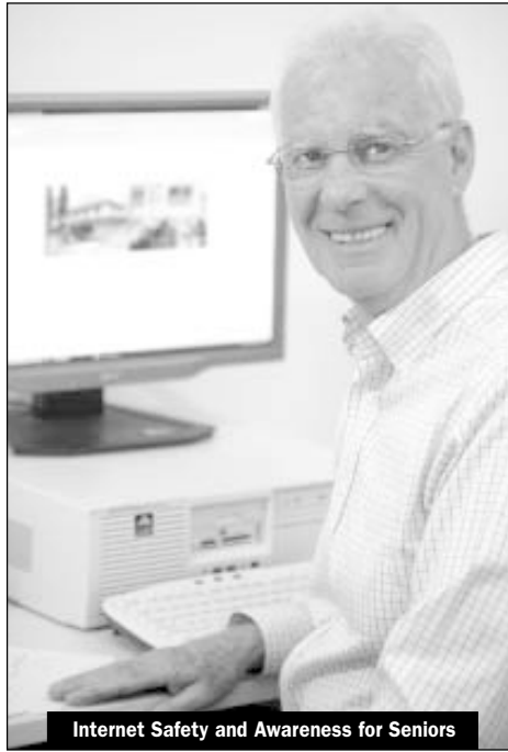
Internet Safety and Awareness for Seniors

08215 Mon., 9am 1 March, 1 day x 6 hrs FEE: $154, disc. $139, conc. $108 WEA CENTRE