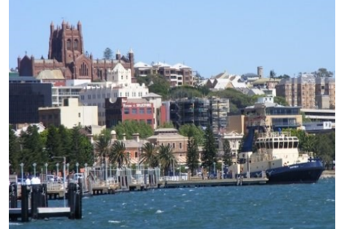
Day 8 Wednesday 18 September