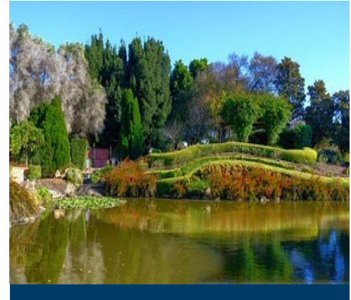
Day 6 Monday 16 September